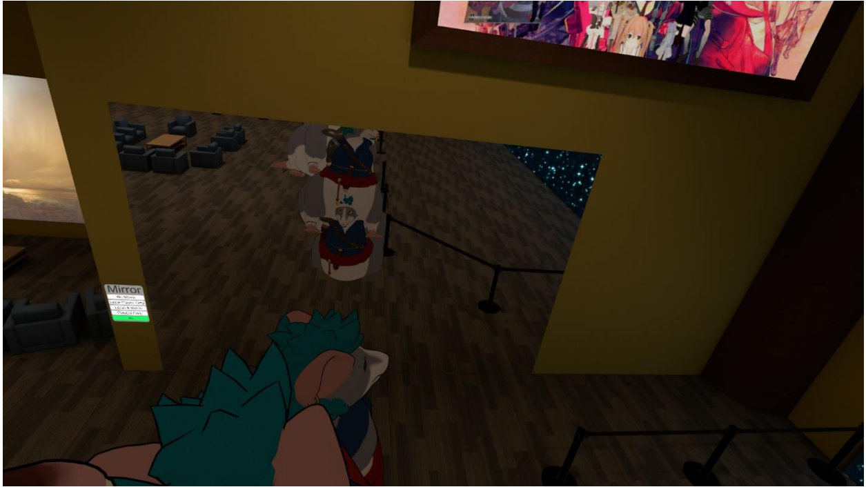
R.A.T – Rising Altitude Tower